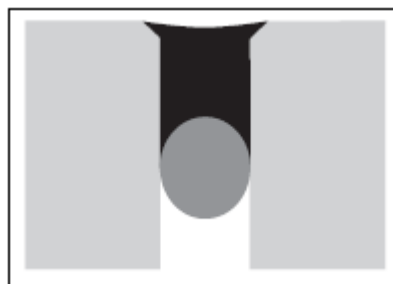
The flush joint design rules out trip hazards and dirt traps.

Backing: Use only closed cell, polyethylene foam backing rods.